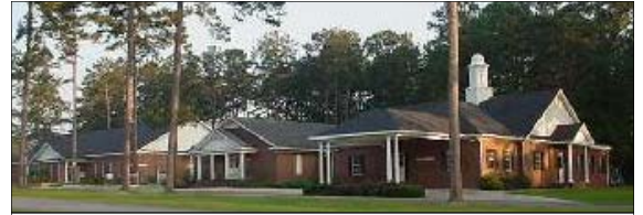
Gatlin Creek Baptist Church